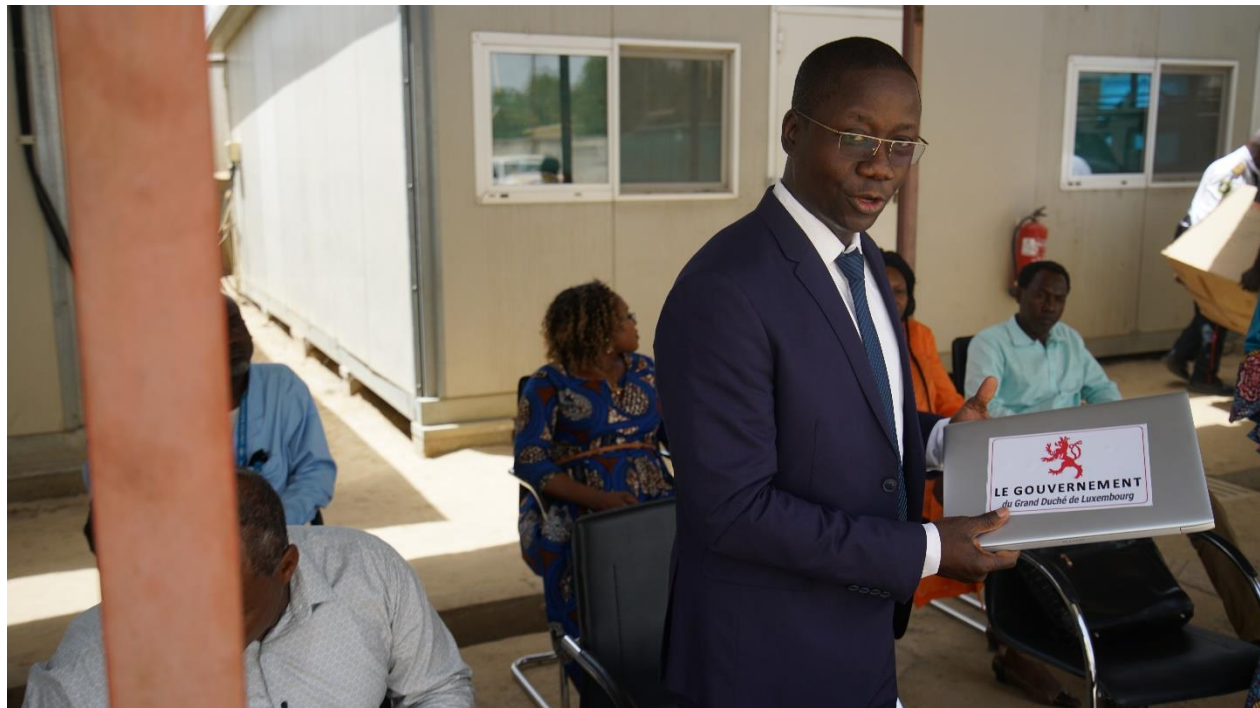
Figure 2: Ceremony of remittance of Office equipment to the Ministerial Coordination Platform of the G5 Sahel - N'Djamena, Chad