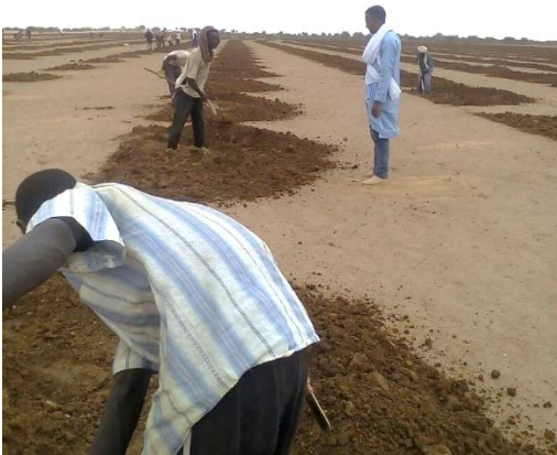
Image 1 : High Intensity Labor activities in Abalak Region involving Half-moons to fertilize the soil for farming and/or grazing