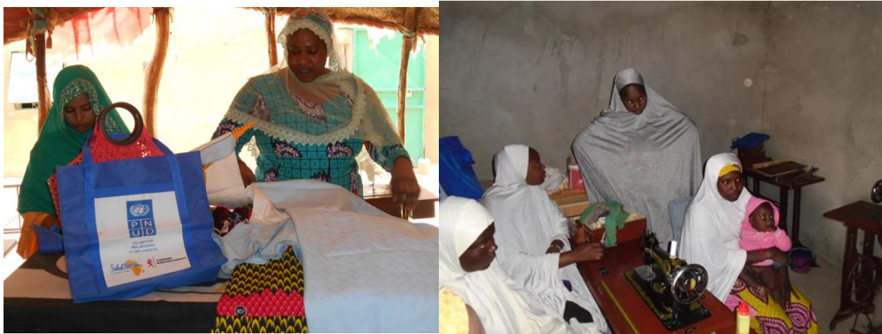
Figure 6: young girls & women beneficiaries of the project trained in sewing-- Abalak, Niger

The Niger component was implemented to achieve outcome 2 of the project "Economic resilience to recurrent crises by supporting inclusive access to resources and sustainable livelihoods is improved" . The beneficiary communes were Abalak (Tahoua region, North-West), Diagourou and Téra (Tillabery region, Liptako-Gourma).