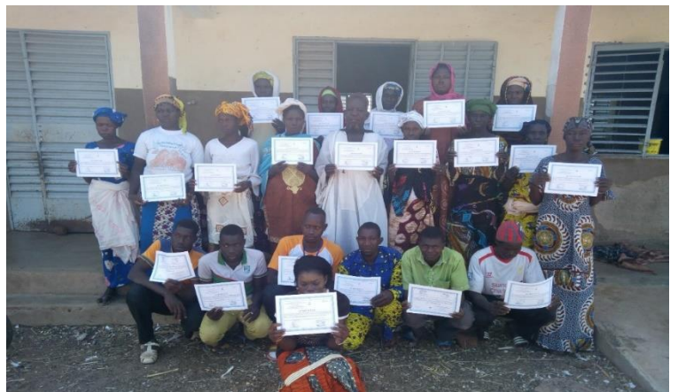
Figure 4: A group of trainees receiving their training certificates in poultry farming

Five hundred (500 of which 430 are young women) young promoters from the Boucle du Mouhoun (mid-West) and North regions were trained (in poultry habitat, poultry feeding, health monitoring), and equipped with local poultry farming skills and inputs. This income stream allows them to improve their livelihoods, and subsequently, the local economy.