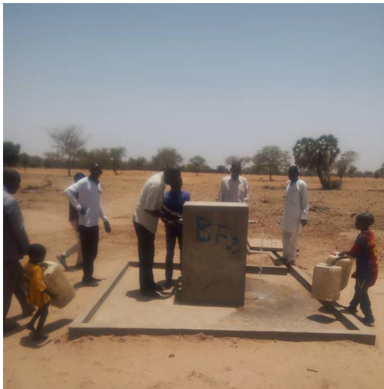
Figure 1: Drinking Water Pump installed in Bengougou, Tillabéry region/Niger