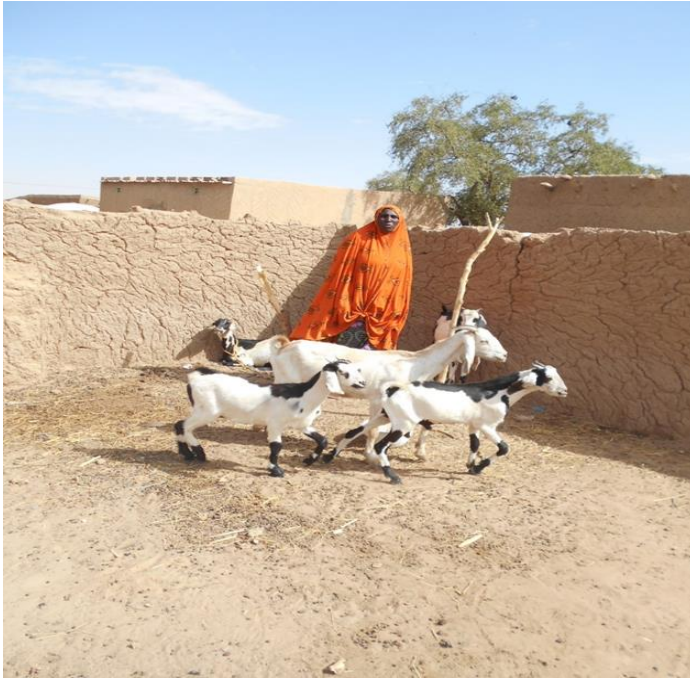
Figure 8: Woman beneficiary of AGR- Small Animals fattening- Abalack, Niger