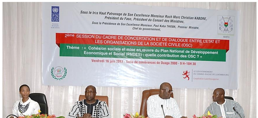
Figure 3: 2nd Session of the concertation & dialogue framework between the Government & CSOs - under the leadership of the President of the Republic and the Prime Minister of Burkina Faso- attended by the UN RC in Burkina Faso

The funding also helped to create a website for the National Office of Religious Facts (ONAFAR): www.onafar.org & www.onafar.bf .