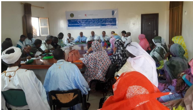
Figure 5: Meeting of border management committees in Aioun, Mauritania